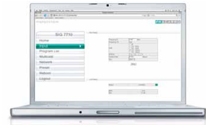
1) Set the input source

The system set-up is extremely easy and user-friendly.