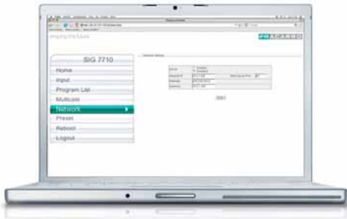
Setting the module IP address

The system can be easily managed remotely: in small installations, we recommend accessing each module directly, while, for large installations, a dedicated module (item SIG7905) is available to manage the whole headend.