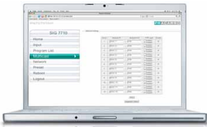
3) Assignment of multicast flows