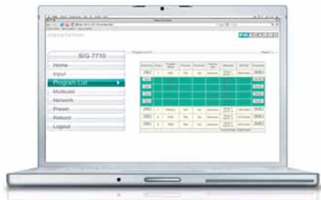
2) Choose the programs that will be available for the transmission (streaming the modules only upon the customers request)